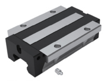
SBI 55 and 65 FL/FLL side grease fitting