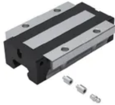
SBI 30-45 FL/FLL side grease fitting (require two FS nipple connectors)