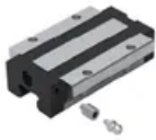
SBI 15-25 FL/FLL side grease fitting (require one FS nipple connector)