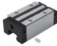
SBI SL side grease fitting