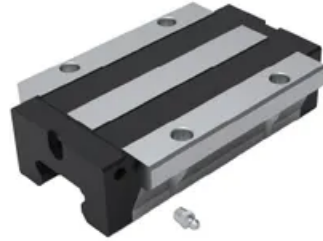
SBI 55 and 65 FL/FLL side grease fitting